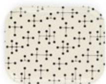
Classic Tray medium, Dot Pattern light