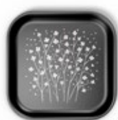
Classic Tray small, Baby's Breath