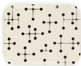
Classic Tray large, Dot Pattern light