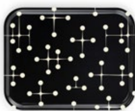
Classic Tray large, Dot Pattern reverse dark