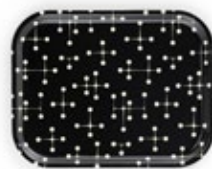
Classic Tray medium, Dot Pattern reverse dark